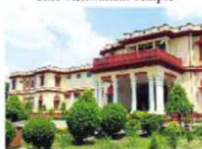
Bharat Kala Bhawan